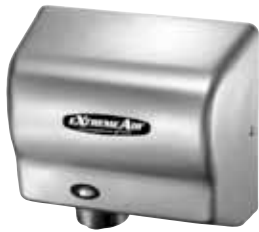
EXTREMEAIR RECESS KIT