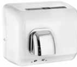
DR-TN White, Automatic