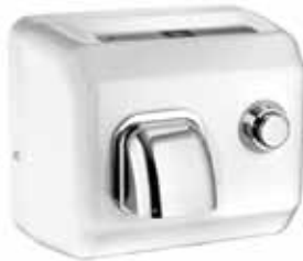
DR-N White, Pushbutton